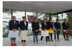
Govt. Sr.Secondary School, Portmore