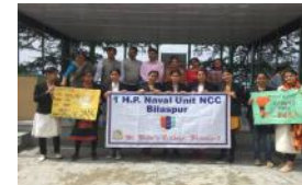
Govt School Bhari.