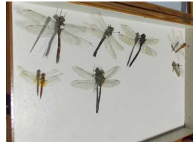
Insect collection through insect nets